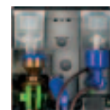
Fresh Brew Version